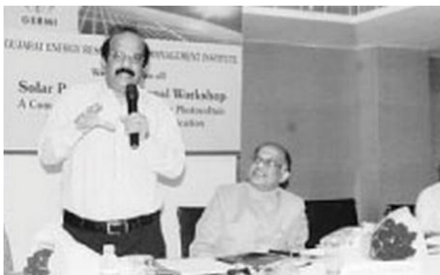
GERMI has been the centre for development of technology related to solar power and trains students from schools as well engineering colleges to install solar panel for domestic use.

The numerous power outages in the city has led to a serious re-think of the power policy by the state government and an assessment of alternative sources of generating power. The pact between Andhra Pradesh and Gujarat in the power sector paved way for the first Solar Power Professional Workshop was inaugurated on Monday at Paryatak Bhavan, Greenland. The Gujarat Energy Research and Management Institute (GERMI) in association with NREDCAP (New and Renewable Energy Development Corporation in Andhra Pradesh) and Titan Energy Systems will conduct a six-day comprehensive workshop on solar photovoltaic design, technology and application, project finance and economics as well as field visits in order to cut-down on consumption of energy generated by non-renewable sources.