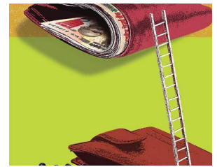
What central government employees can expect from the 7th Pay Commission