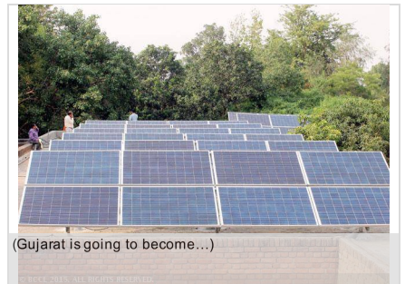
(Gujarat is going to become...)

According to officials in Gujarat Energy Research and Management Institute (GERMI), farmers and power generation companies will be in a win-win situation with generation of solar energy in agricultural fields.