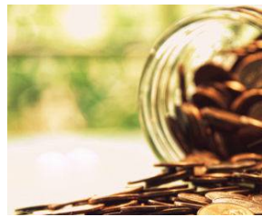
10 best tax-saving investments