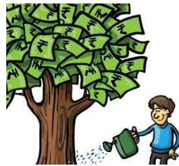
Top 10 companies that pay more than 25% dividend