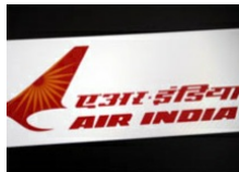
No closure of Air...