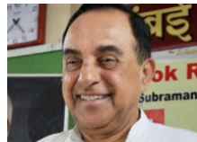
Why is Subramanian...