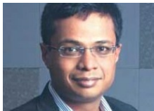
Sequoia isn't an...