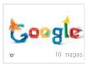
Top 10 Google doodles of 2012