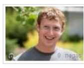
Billionaire college dropouts