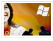
This Week In Tech - Week 16, 2012