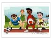
Olympic Google doodles