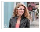
Google's Project Glass and other augmented reality uses